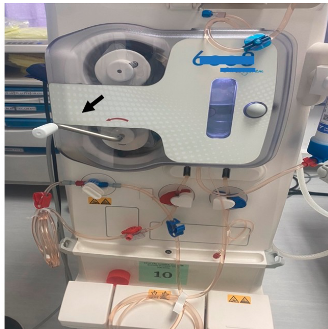
Figure 2. The hand crank method, whereby blood can be manually returned to the patient in the event of a power outage without backup batteries.

Such training enhances their preparedness to handle emergency situations safely and effectively [13]. It is crucial that healthcare facilities prioritise comprehensive training programs that cover all three methods to ensure readiness for various emergency scenarios.